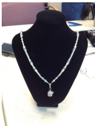
A completed Joined in Hope necklace.